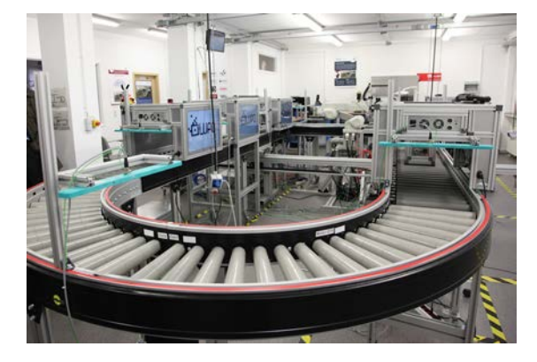
Fig. 1. Hybrid Simulation Environment in Anwendungszentrum Industrie 4.0

The analysis of the effects of autonomy on complexity uses a simulation environment provided by the Lab of Anwendungszentrum Industrie 4.0 at Potsdam University. The hybrid simulation environment as a combination of software simulation and physical model factory enables a configuration of all production objects of the simulation environment for different levels of decentralised production control, e. g. as cyberphysical systems (CPS) in variable extent. The term production objects comprise elements of a production system like machines, working stations of plant components as well as software systems and human workers. All of them are available in virtual or real nature which is freely combinable within the runtime environment of this simulation platform. This allows modelling and analysis of several production processes as well as various scenarios with different levels of autonomy [21,32]. Though, this tool enables a simulation based approach for exploration and validation. Fig. 1 shows a part of the Anwendungszentrum Industrie 4.0 in Potsdam.